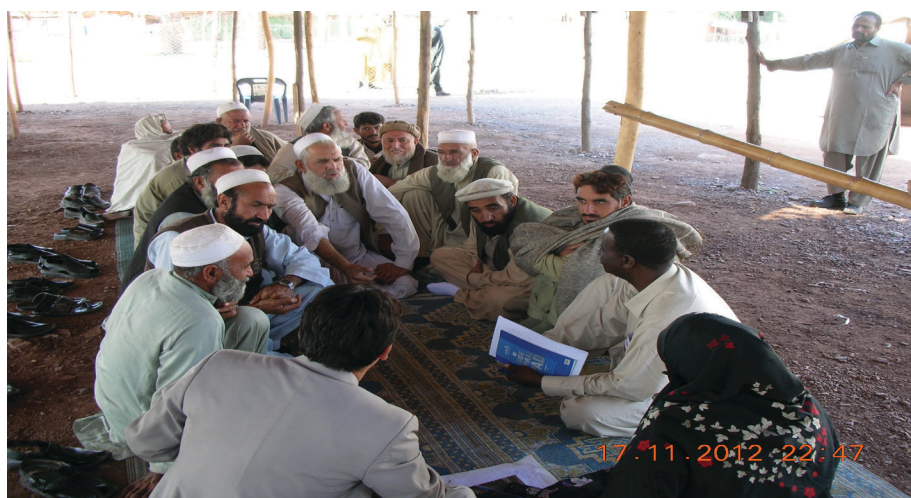
Figure 2: Discussion with beneficiaries in Jalozi, Pakistan