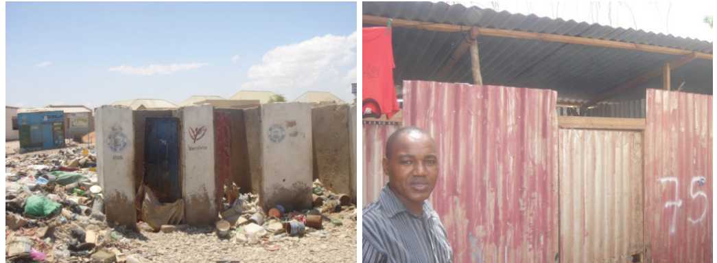
Figure 11: Non-NRC unmaintained latrines in Bossaso (left) and NRC well-maintained latrines in Mogadishu (right).