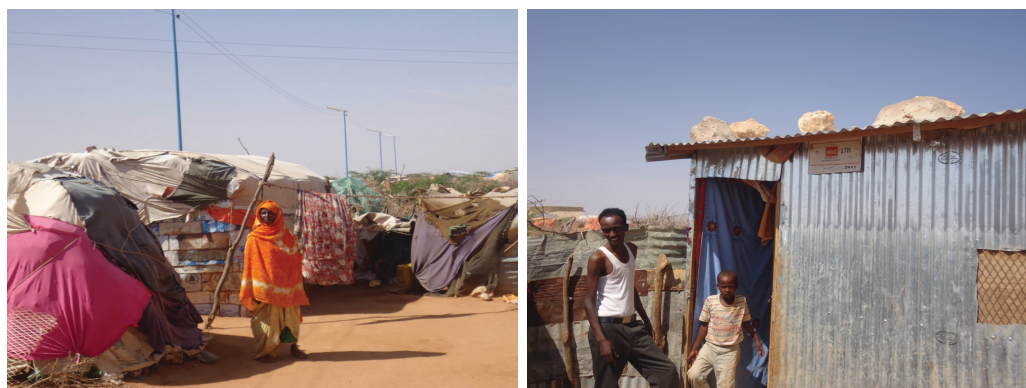
Figure 4: Traditional shelter (Tukus) and Improved Semi-Permanent shelter at Aden Suleiman camp in Burao, Somalia

The team found that the NRC support systems, including procurement, management, local adaptation of operating procedures, physical verifications of deliveries and checks and balances in distribution functioned well. There remained challenges related to post distribution monitoring. Only some of these were related to security and gender.