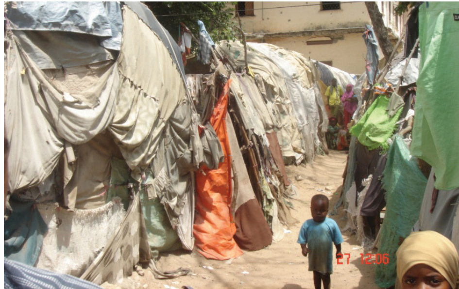
Figure 5: A crowded IDP settlement in central Mogadishu where NRC plastic sheets complement traditional buuls

NRC had shelter activities in all three countries included in the evaluation. Below, we first present a brief summary of the shelter activities in the countries visited, then present findings related to shelter.