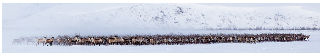
Canadian Reindeer Herd.

There has been good progress on outreach and knowledge development activities, and especially so regarding EALLU and Rievdan WP3. GEF/ UNEP Nomadic Herders has also had good progress, the external conditions taken into account.