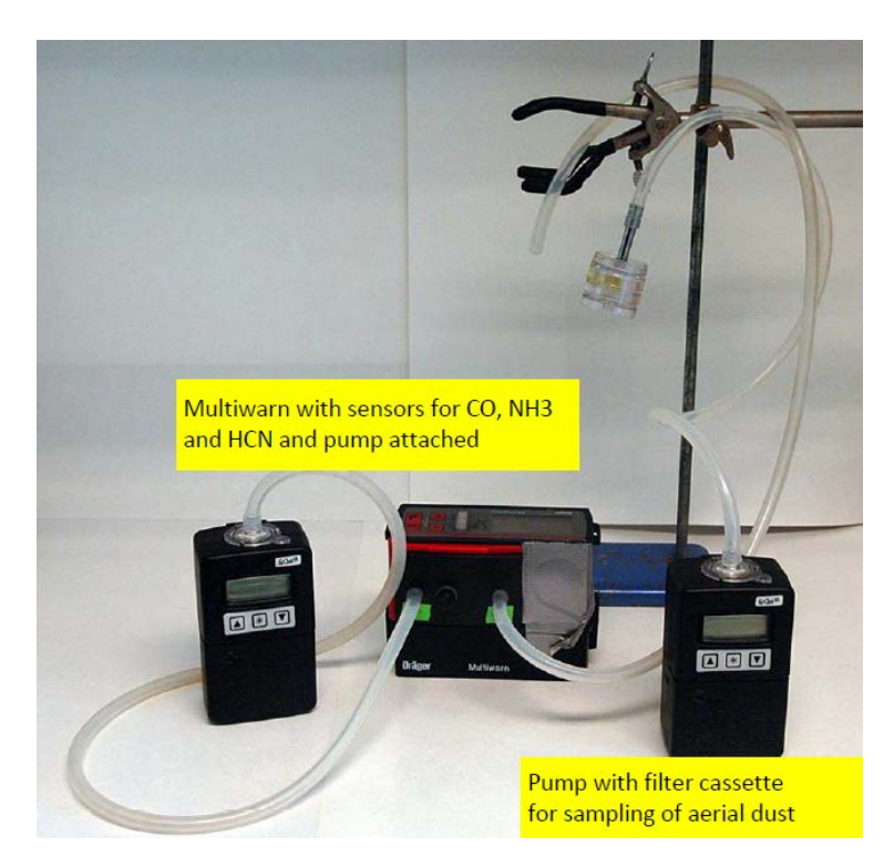
Figure 5.2 Instruments for the analysis of the gases CO, NH_3 og HCN and the filter for dust sampling from the chamber.