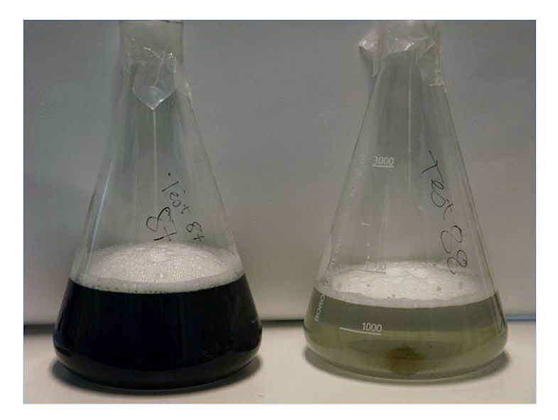
Figure 5.3 Water collected after cleaning of the polyethylene sheet. The two bottles are from two different ammunitions.