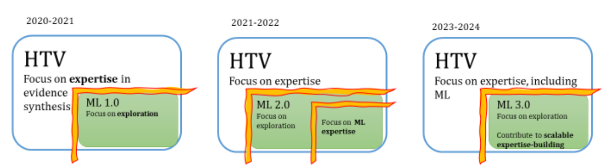
Figure 1: Division of exploration and expertise in HTV

Balancing these two competing needs – to build expertise and to explore – have been a challenging and valuable activity. In Figure 1 below, the division of exploration and expertise is shown in yellow. To maximize the potential of ML 3.0 to rapidly identify, assess, and roll out ML-related innovations and changes, we suggest the following strategy.