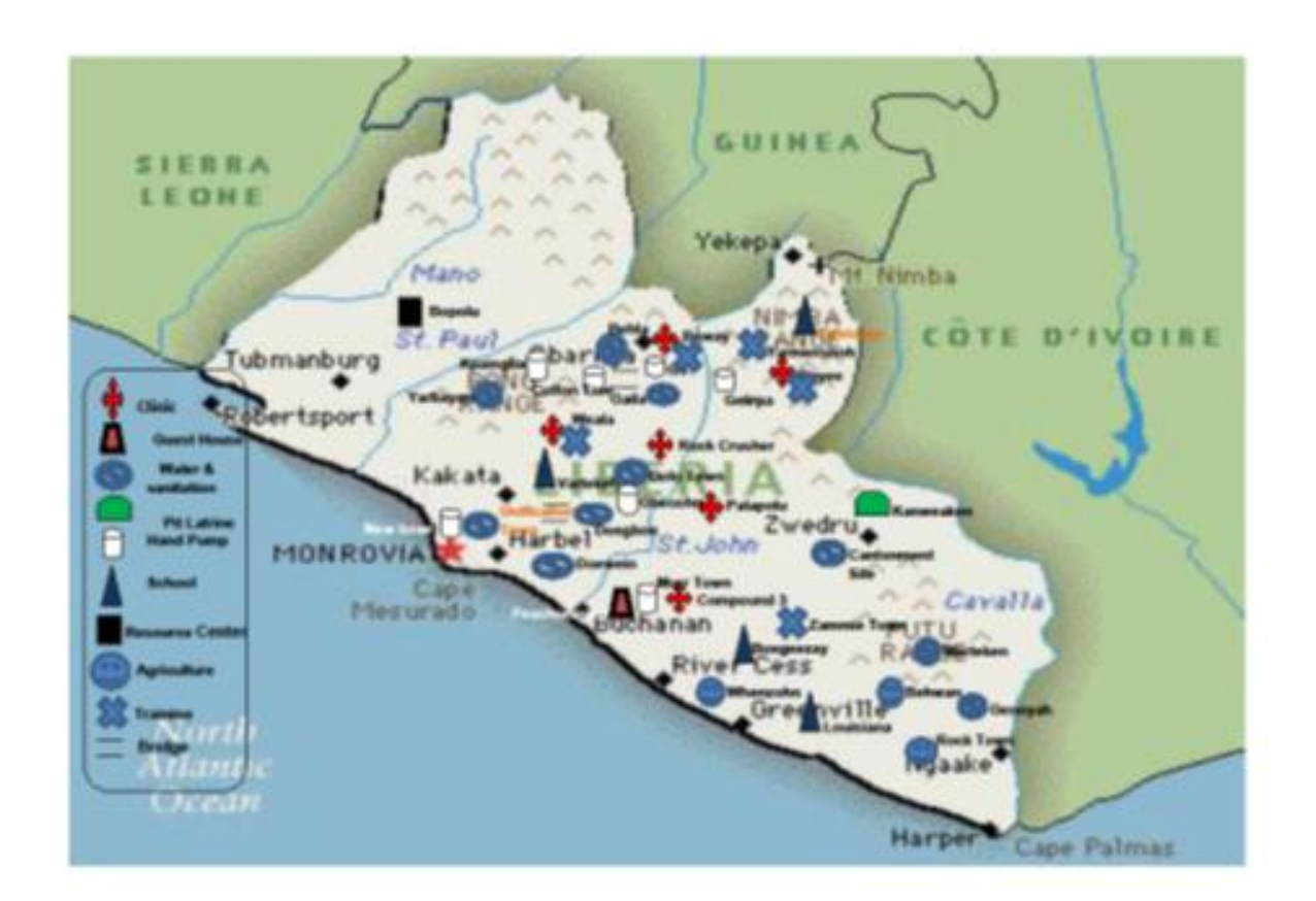
Figure 2: Map of Liberia and projects