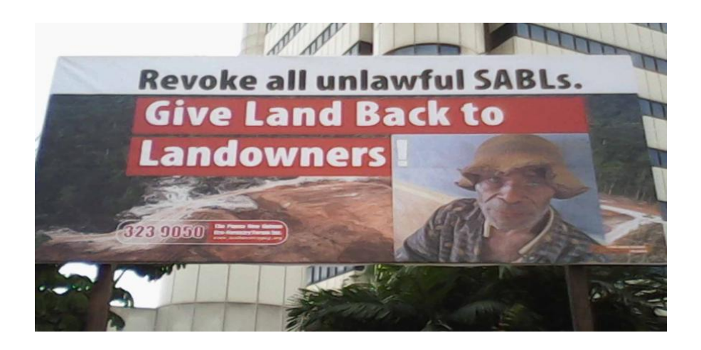
Figure 8: Billboard in front of the driveway into the Parliament House showing ongoing advocacy against SABLs

One participant noted that CELCOR was always present and vocal for meetings on forestry and land matters while another stated that they always invited CELCOR to forums because they actively participate. For example, only Transparency International and CELCOR had commented on the recent Climate Change Bill to the Climate Change Development Authority.