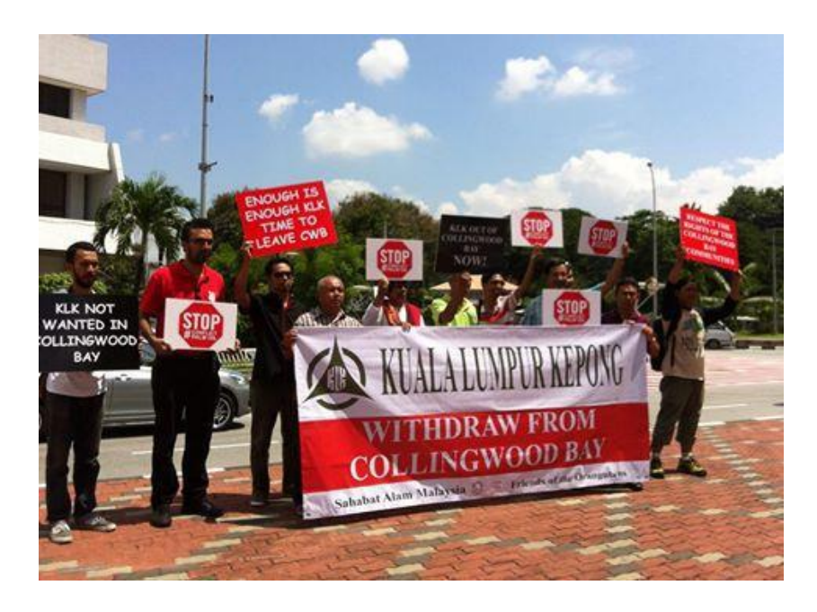
Figure 5: Protests against illegal land grabbing in Collingwood Bay by partners in Kuala Lumpur, Malaysia

Most recently, CELCOR has successfully assisted a number of clients in the Pomio District in matters dealing with the police. In this matter, CELCOR acted for West Pomio landowners who were being restricted and/or restrained from accessing their customary land (the subject of a dubious SABL concession). The restrictions arose on the basis of allegations by the developer that the community members were disrupting the smooth implementation of an oil palm project.