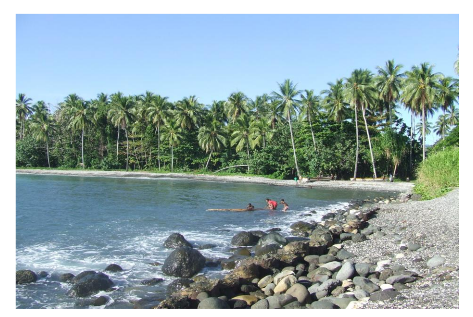
Figure 9: Trip to Saidor, Rai Coast District- Madang Province 2014 under the Packard Marine Program