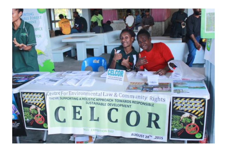
Figure 10: CELCOR stall at NGO Exhibition on Sustainable Development University of PNG, 28 August 2015

One achievement has been CELCORs regular participation in the annual NGO Exhibition. For example, in August 2015 this exhibition was staged at the University of Papua New Guinea's Open Forum. The theme of the event was "Supporting a holistic approach to responsible sustainable development" which reflected that government's Responsible Sustainable Development Strategy. The exhibition celebrated the key role of NGOs such as CELCOR as important contributors to sustainable development in PNG. More than 20 partner NGOs participated in this event, covering a variety of sectors such as health, environment, education, and humanitarian.