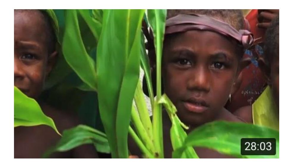
Figure 7: Video still from YouTube video called SABL:

CELCOR also produced a 28-minute video on YouTube drawing attention to the issues. The video is called SABL: A Misconceived Development Perception in Papua New Guinea and is available at https://youtu.be/dIZrZX7fpiw