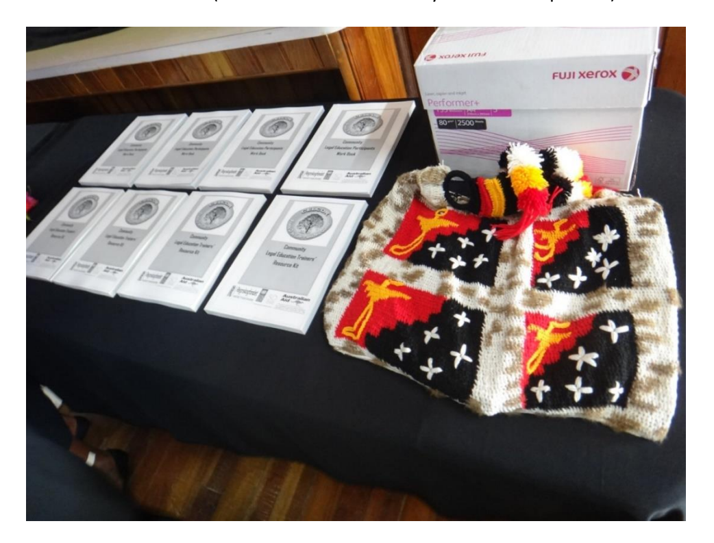
Figure 1: Copies of the Environmental Law Toolkit for Trainers and Communities at the launch held at the Wellness Lodge, March 2017.

The launch of the toolkit generated interest from the media within Papua New Guinea including The National, Post Courier, TV1 and EMTV (see below).