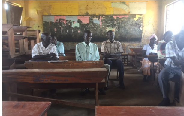
Meeting with beneficiaries and local partners in Amaru, Northern Uganda.

4: Any major increase in the effectiveness of Norwegian support to civil society strengthening requires a better coordination of different Norwegian aid instruments and support modalities. This may best be addressed at the country level with a better coordination between support provided by Norad's civil society department, the Ministry of Foreign Affairs and the Norwegian Embassies. This presupposes a shift to a more strategic use of Norad's civil society grant.