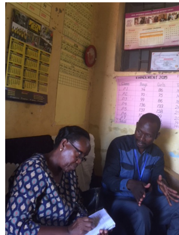
Meeting with beneficiaries and local partners in Amaru, Northern Uganda.

provide knowledge that that will be useful in the further development of new policies and approaches to strengthening of civil society.