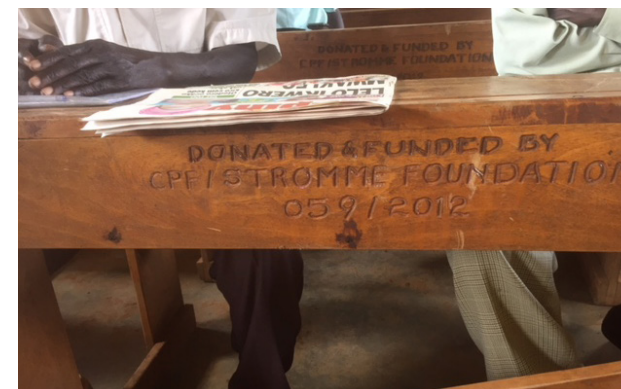
Meeting with beneficiaries and local partners in Amaru, Northern Uganda.

Several Norwegian CSOs, and an increasing number, are now working through their international associations – Plan Norway (Plan International), Save the Children (Save the Children International), Red Cross (International Committee of the Red Cross), Norwegian Church Aid (ACT alliance), World Wildlife Fund Norway (World Wildlife Fund) and others. Justified by concerns related to harmonization of donor support and aid effectiveness, we may see