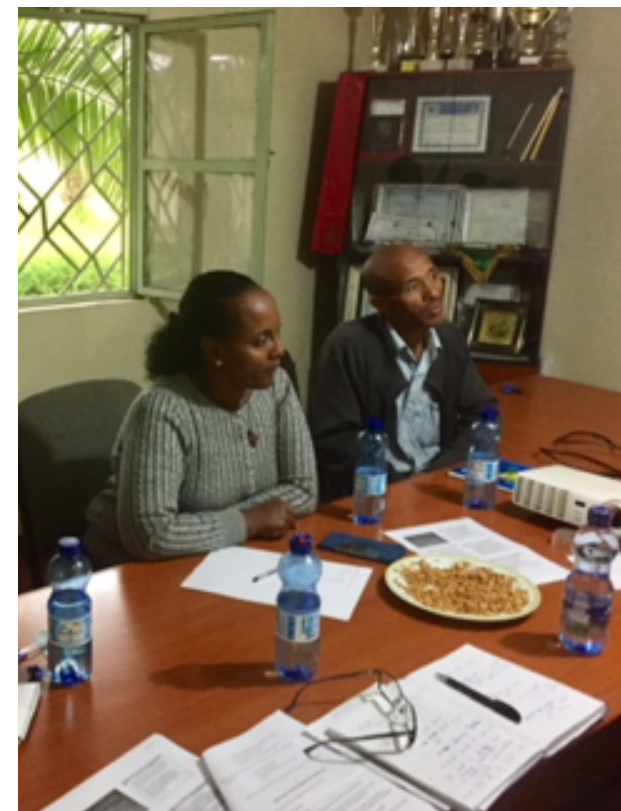
Meeting with staff of Mary Joy Development Association, a child rights organisation established with the support from Save the Children Norway.

period, while 27 organisations were active for a period for more than five years. Six organisations were active in all three countries, while 17 were active in at least two. 5